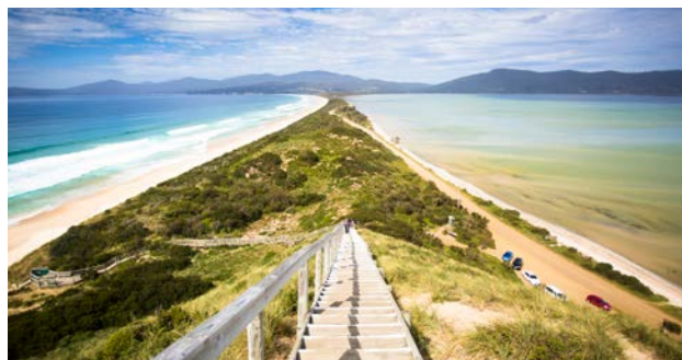
The Neck, Bruny Island