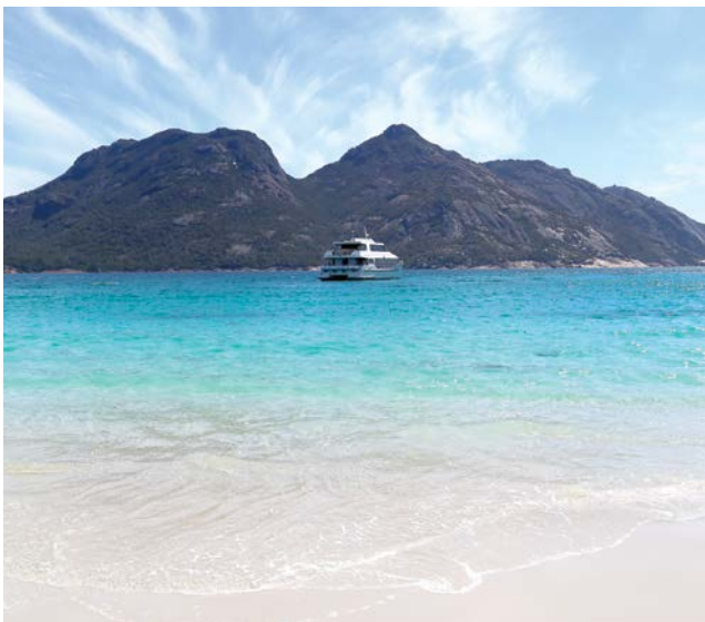
Wineglass Bay Cruises

having lunch at Bangor Wine & Oyster Shed near the picturesque fishing village of Dunalley. Explore the many coastal formations of the Tasman National Park, including the Tessellated Pavement, Devil's Kitchen, Tasman Arch and the Blowhole. Drop into the Tasmanian Devil Unzoo, where you can get up close to the Tasmanian devil. Spend the afternoon delving into the stories of Tasmania's convict past at the Port Arthur Historic Site. The adventurous can opt to do an evening Ghost Tour or Paranormal Investigation Tour, to see a very different side of this UNESCO World Heritage Listed convict site. Dine at either Felon's Bistro or Gabriel's restaurants.