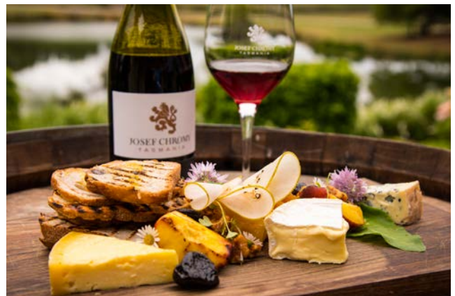
Josef Chromy Wines

Drive to the East Coast in time to jump aboard the Wineglass Bay Cruise. In the afternoon, choose a walk to Wineglass Bay