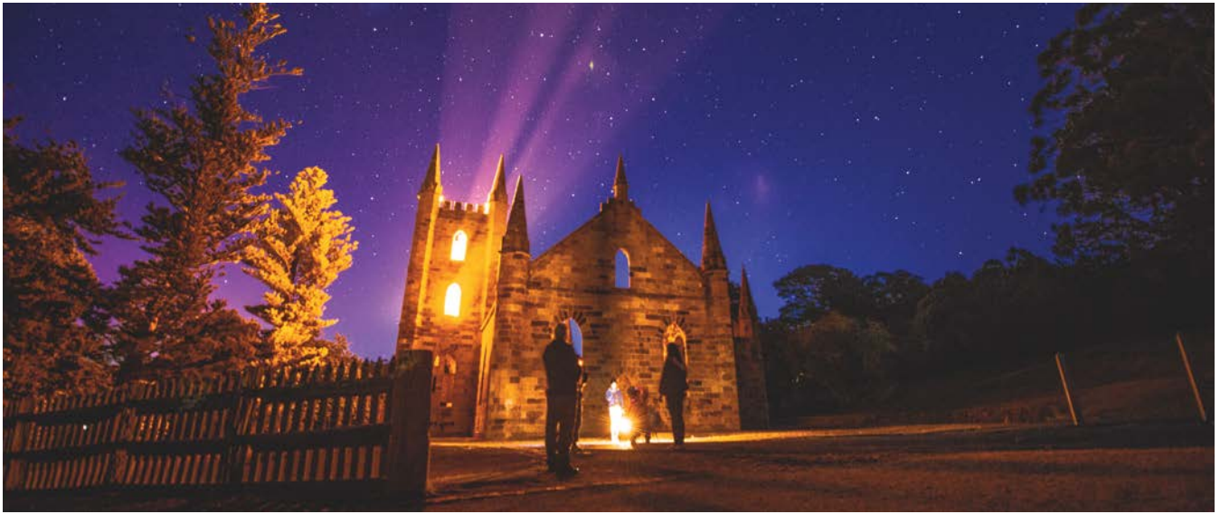
Port Arthur Historic Site