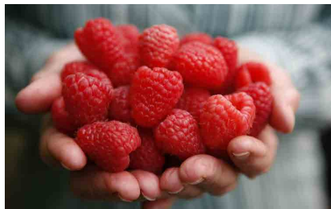
Christmas Hills Raspberry Farm Cafe

#discovertasmania fb.com/tasmania @tasmania